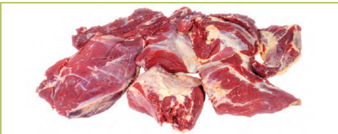
Frozen Boneless Beef - Forequarter