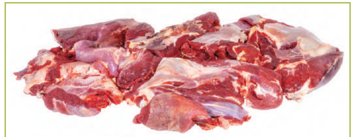
Frozen Boneless Beef - Hindquarter