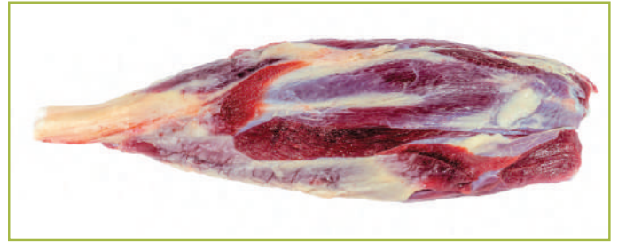
Hell muscle with golden coin